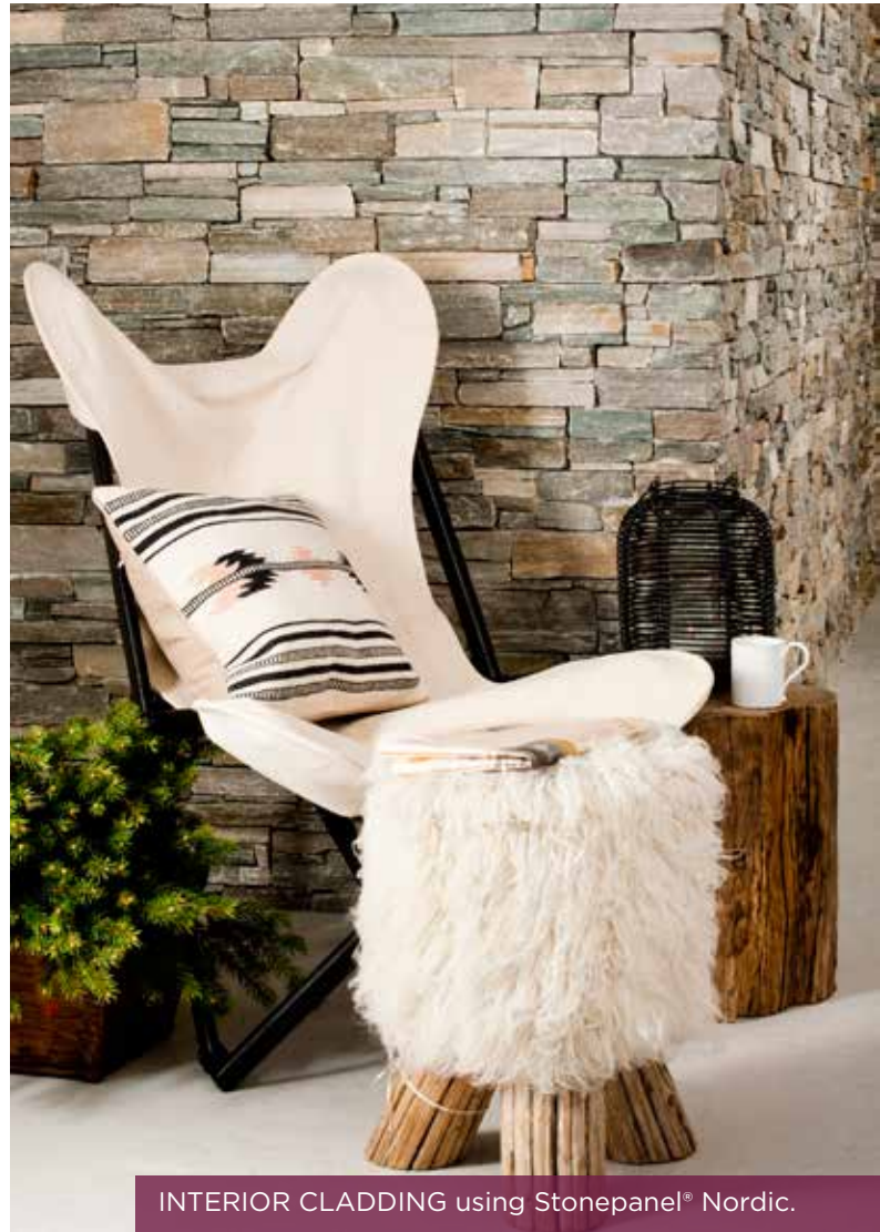
INTERIOR CLADDING using Stonepanel® Nordic.