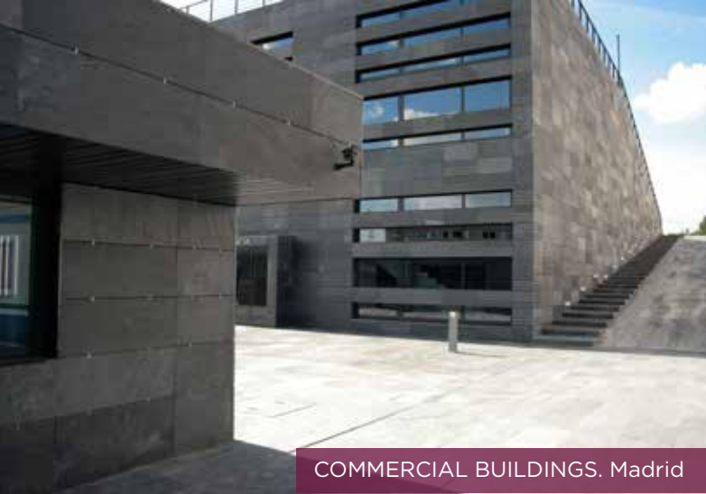
COMMERCIAL BUILDINGS. Madrid