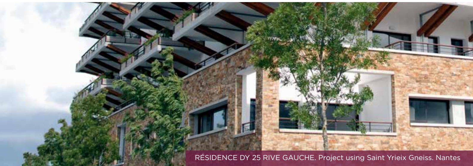
RÉSIDENCE DY 25 RIVE GAUCHE. Project using Saint Yrieix Gneiss. Nantes