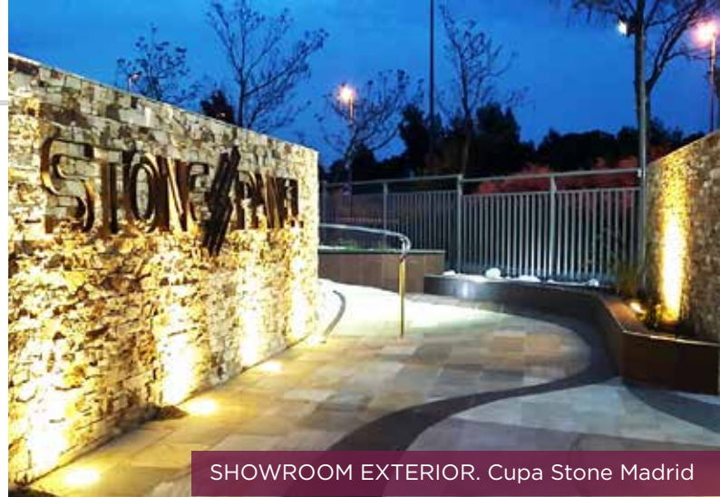
SHOWROOM EXTERIOR. Cupa Stone Madrid